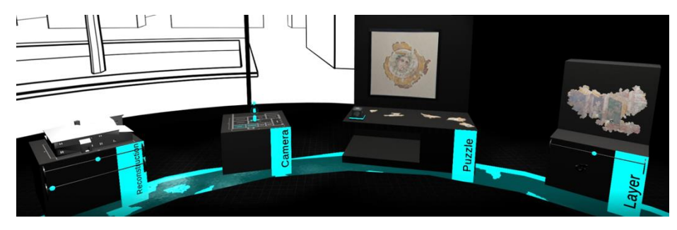
Fig. 1. The VR player can choose between four virtual workstations. The stations are arranged from right to left ( Layer , Puzzle , Camera , and Reconstruction ).

Due to the limitations found at museums and public spaces for VR settings (space, security, abrasion of the hardware, etc.), VHM was designed as a seated VR installation. The user is surrounded by four platforms in a virtual museum and can choose between four virtual workstations by looking at one of these platforms.